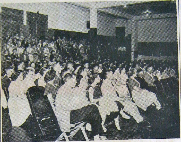
Shown above are some of the Arnold Alumni who attended the 1957 Alumni Reunion. This was part of the 300 members who attended the banquet and program.

Honor Classes — 1928 - 1938 - 1948 - 1958