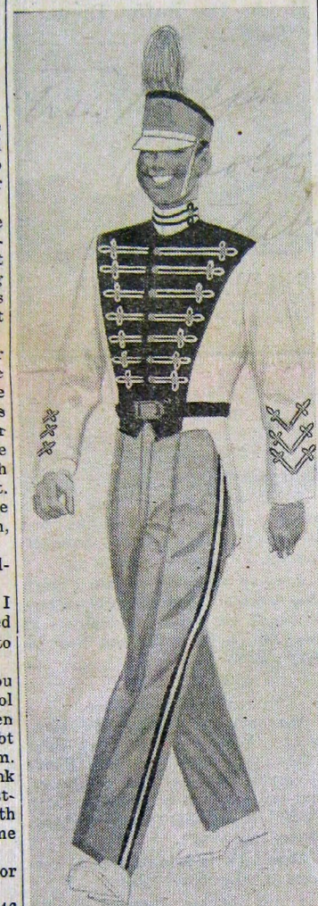
Above is pictured the new band uniform which were purchased this year for the Arnold schools.

The local P.T.A. has been active in assisting with this project.