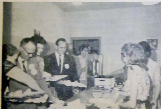
"And a little bit of this, and some of that, - and that . . ."