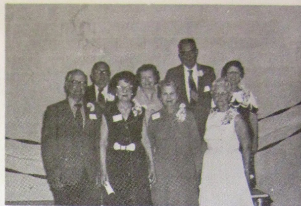
Eight of the nine living members of the Class of '22 were at the banquet. Fifty years of friendship are pictured here.