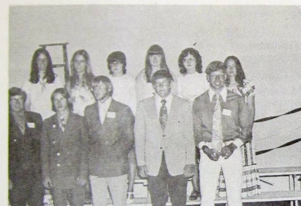
"Look what we have here!" The class of '72.