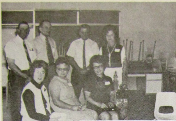
"Time has been so-o-o good to us." Class of '42.