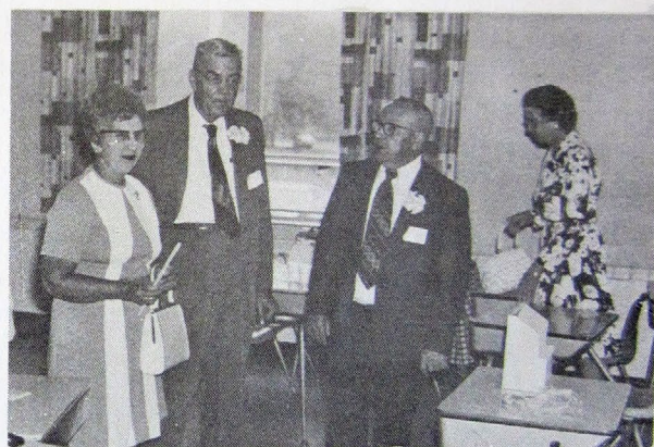
The afternoon reunion of the class of '22.