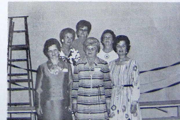
"We're still just as bashful as we were in our school days" Class of '32.