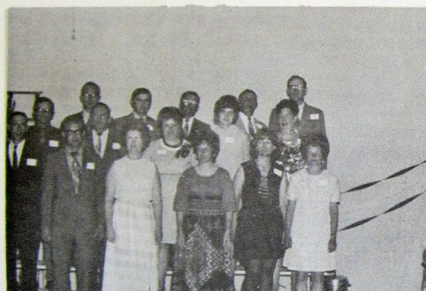
"They still look like the orn-eriest class that ever passed through those immortal halls." Class of '52.