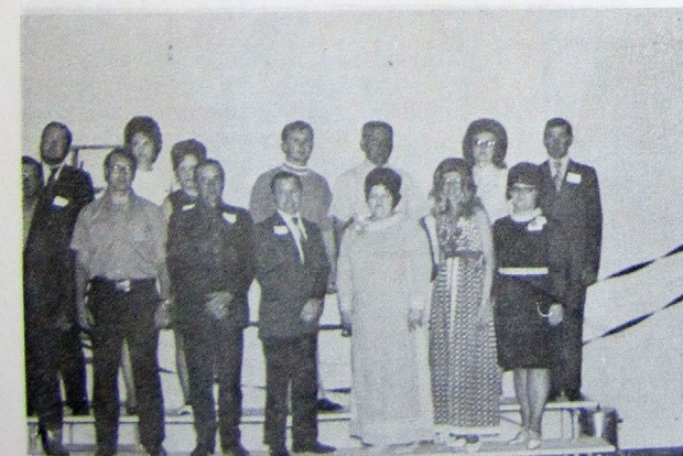
"When our class gets together, things happen!" Class of '62.