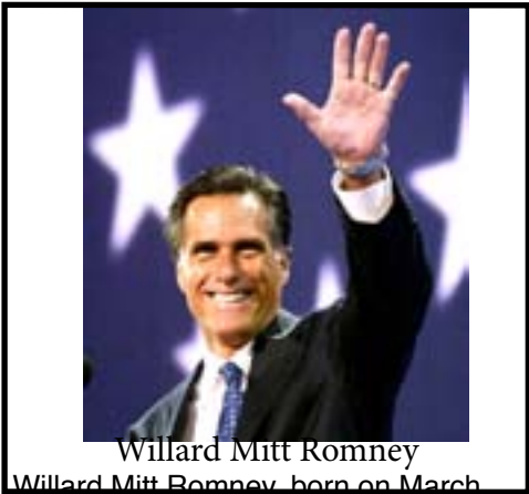
Willard Mitt Romney, born on March 12, 1947, is the official candidate of the Republican party for 2012. He is the 70th governor of Massachusetts. He is the cofounder and CEO of Bain Capital. His vice presidential nominee is Republican Paul Ryan. Romney is married to Ann Romney (1969-present). He has 5 sons, and eighteen grandchildren. Many people saw him as saving the 2002 Winter Olympics by revamping the leadership and fixing the budget.

Whatever happens, let's just hope that our president can guide us wisely through the next four-year term. October 3, 1992-present