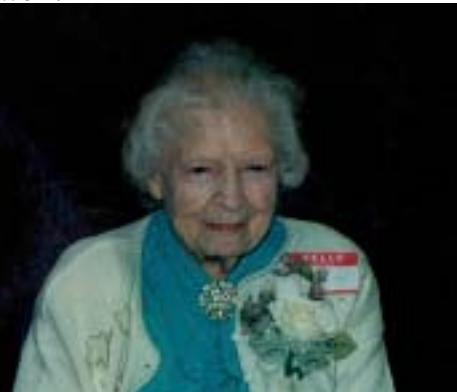
Can you guess who she is?