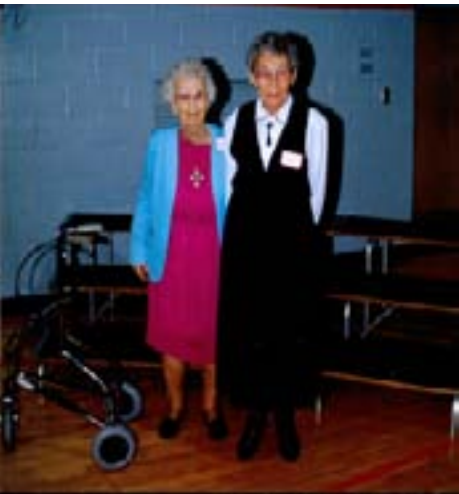
Can you guess who these two are?