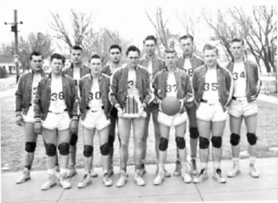
Do you know who these people are and what championship game they won?

We have ran into an issue, that you can help with though. We have some "unknown" people in the following pictures. If you know who they are, please contact us at: Phone: 1-(308)-848-2226 Mailing Address: P.O. Box 399 405 North Haskell Arnold, NE 69120 Email: nbadgley@esu10.org