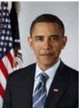
Barack Hussein Obama, born on January 20, 2009, is the official candidate of the Democratic party for 2012. He is the current 46th president. He was born in Honolulu. Obama is known as the first African-American president of the United States. Barack Obama is a big example of how far we have come to making all races come equal. Barack Obama has 2 daughters.