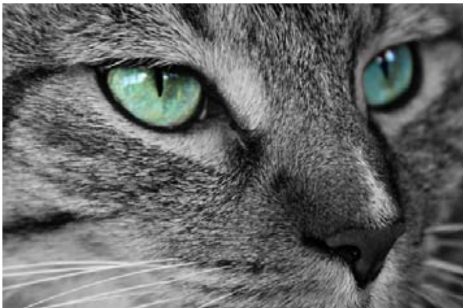
Leah's winning photo, “Feline Perspective”.