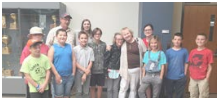
Pictured above are the 6th graders with their favorite author of the day, Lin Oliver. Backrow LtoR:

All in all, the trip for the 6th graders was an enjoyable and very educational trip.