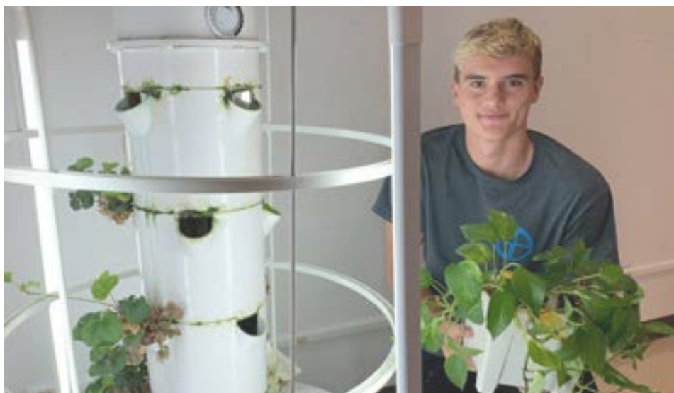
The students will be growing different types of plants second semester after they create their business plans and set up their new class.

This project is funded by a grant from the John Russell Applegate Fund administered by Mid-Nebraska Community Foundation.