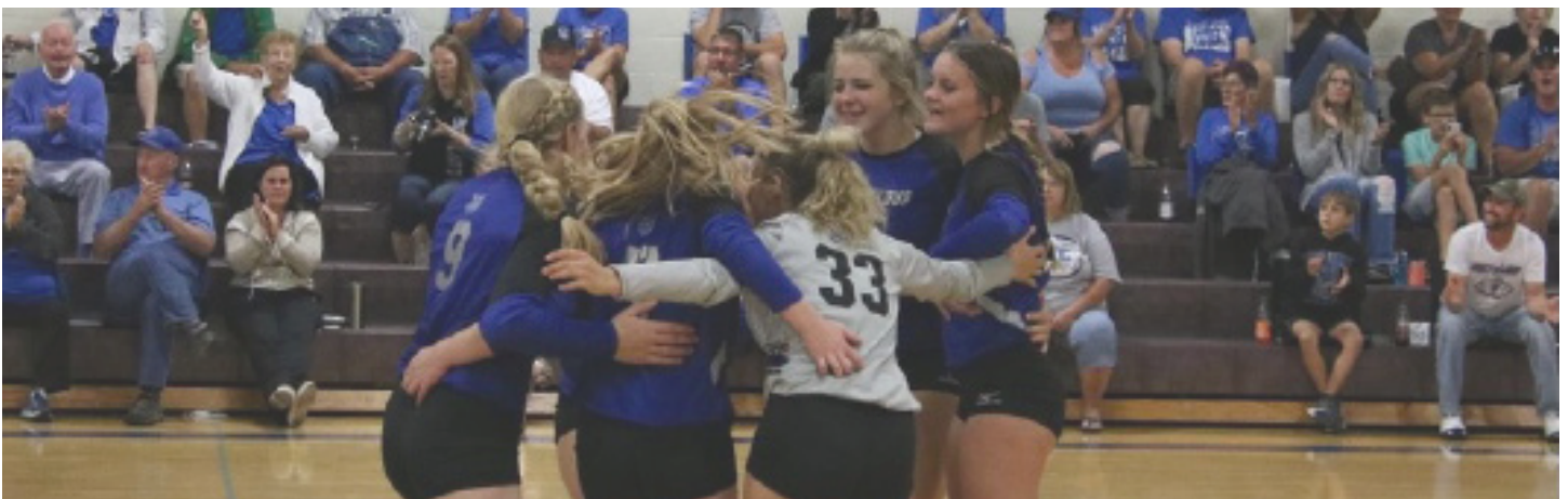
The South Loup Lady Cats huddle together after scoring a point.

Very good job girls you played as well as you could.